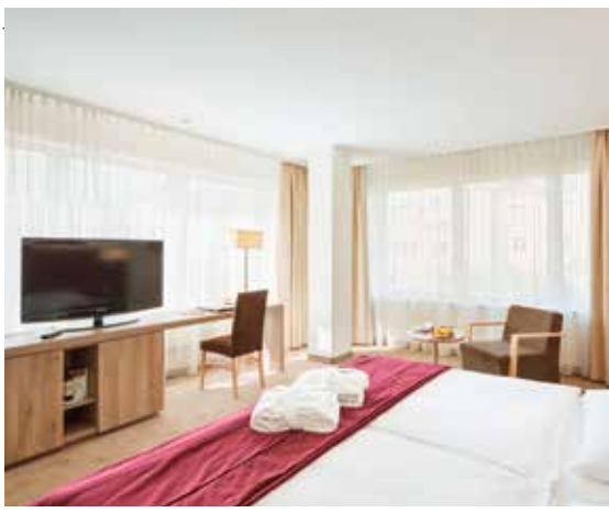
Free WiFi access in all rooms!