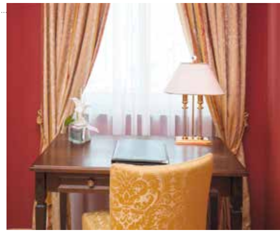
Free WiFi access in all rooms!